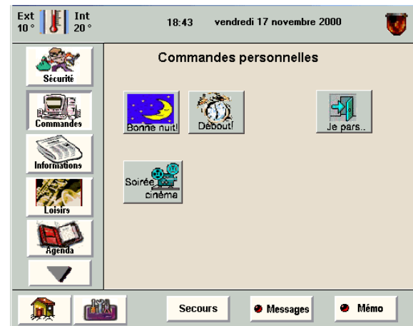
Example of design solution for a touch panel.

etc.). We suggest that for all devices, a dedicated zone independent from any service serves for accessing these “personal commands” and shortcuts. Figure 2 illustrates one solution proposed for a 10” touch panel.